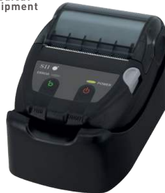
MP-B30 Cradle option