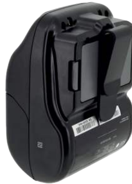
MP-B30L Belt Clip